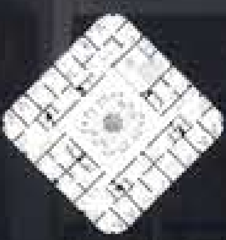
FOURTH FLOOR OFFICES