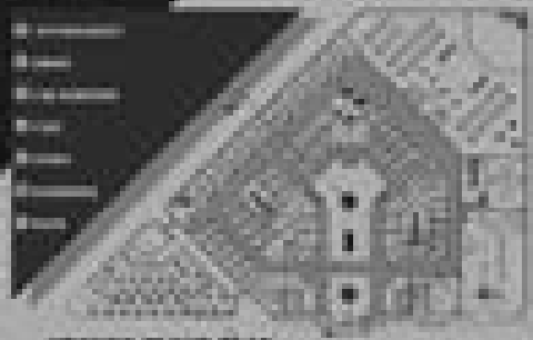
PROPOSED PLANNING PLAN