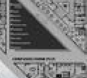
PROPOSED PLANNING PLAN