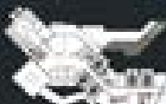
2. EXTERIOR FLOOR