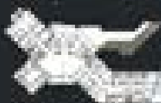
1. EXTERIOR FLOOR