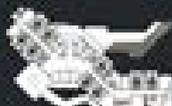
3. EXTERIOR FLOOR